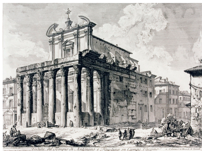
Giovanni Battista Piranesi (1720-1778) View of the Temple of Antoninus and Faustina in the Roman Forum from the series Vedute di Roma (Views of Rome), c.1748-1760, etching, ink on paper, 40.8 x 54.8 cm (plate), Collection of Flinders University Museum of Art 129.