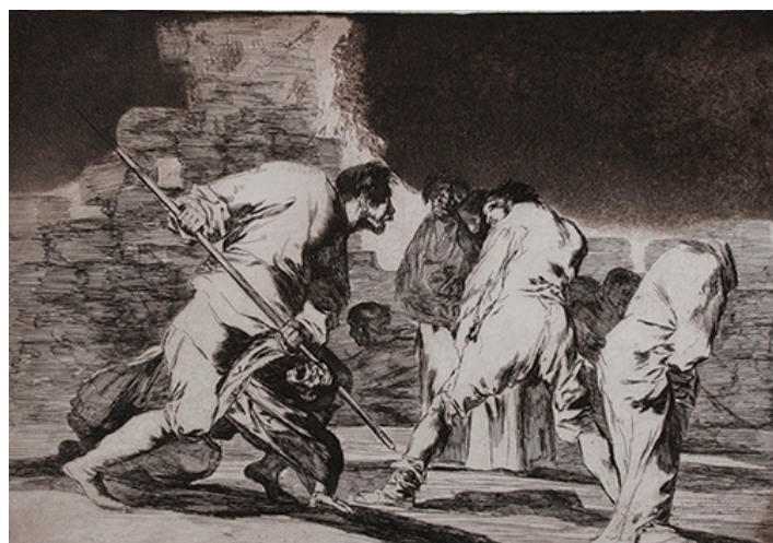
Francisco Goya (1746-1828), Furious folly ( Disparate furioso ), plate 6 from Los Disparates ( The Follies ), 1816-24, published 1864, etching and aquatint, ink on paper, 25.0 x 36.5 cm (plate), Collection of Flinders University Museum of Art 77.